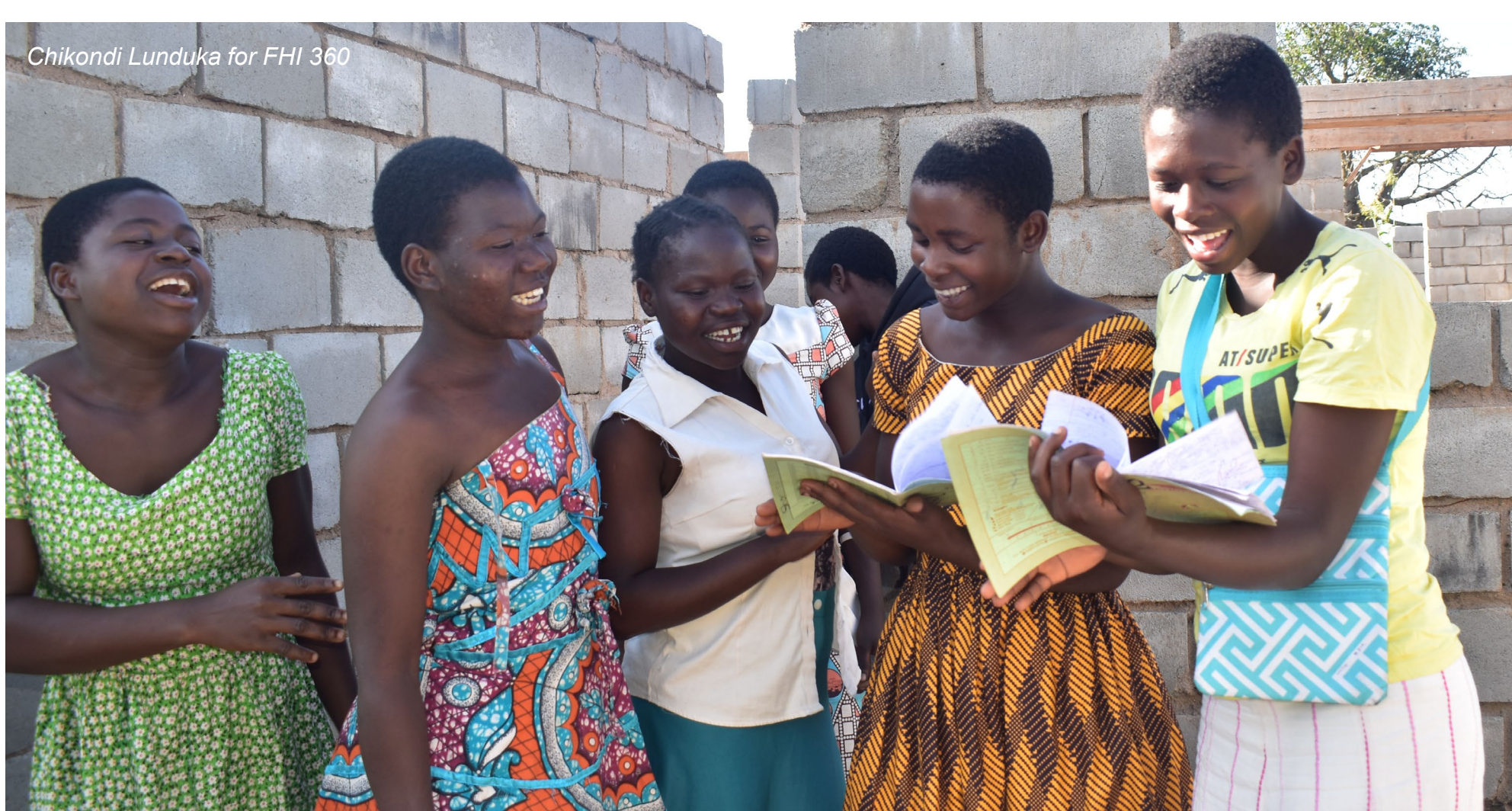
AGYW participants sharing notes after a focus group discussion

We conducted 12 focus group discussions (FGDs) in Zomba (n=6) and Machinga (n=6) districts in October 2021 involving (n=70) AGYW aged 15–24 newly initiated on PrEP, (n=36) screened eligible but declined PrEP, and reviewed PrEP trackers for non-continuing users. Follow-up FGDs in December 2021 targeted (n=60) continuing and (n=15) non-continuing AGYW. We transcribed FGDs, examined data, did a thematic analysis, and interpreted the themes into context.