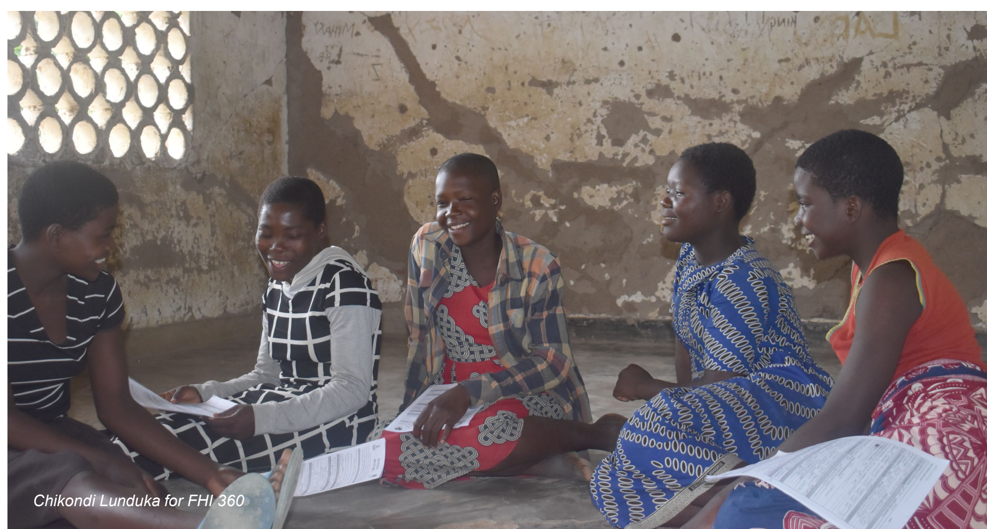
A group of AGYW participating in a study focus group discussion

Pre-exposure prophylaxis (PrEP) was approved by the Malawi Ministry of Health in October 2020. In March 2021, PrEP was initiated in the Determined, Resilient, Empowered, AIDS-free, Mentored, and Safe (DREAMS) clubs by the Expanding Malawi HIV/AIDS Prevention with Local Organizations Working for an Effective Epidemic Response (EMPOWER) project. PrEP uptake among adolescent girls and young women (AGYW) was low, yet the contributing factors were not well understood. We conducted a qualitative study to explore barriers and facilitators to PrEP uptake and continuation among AGYW to inform the development of improvement strategies.