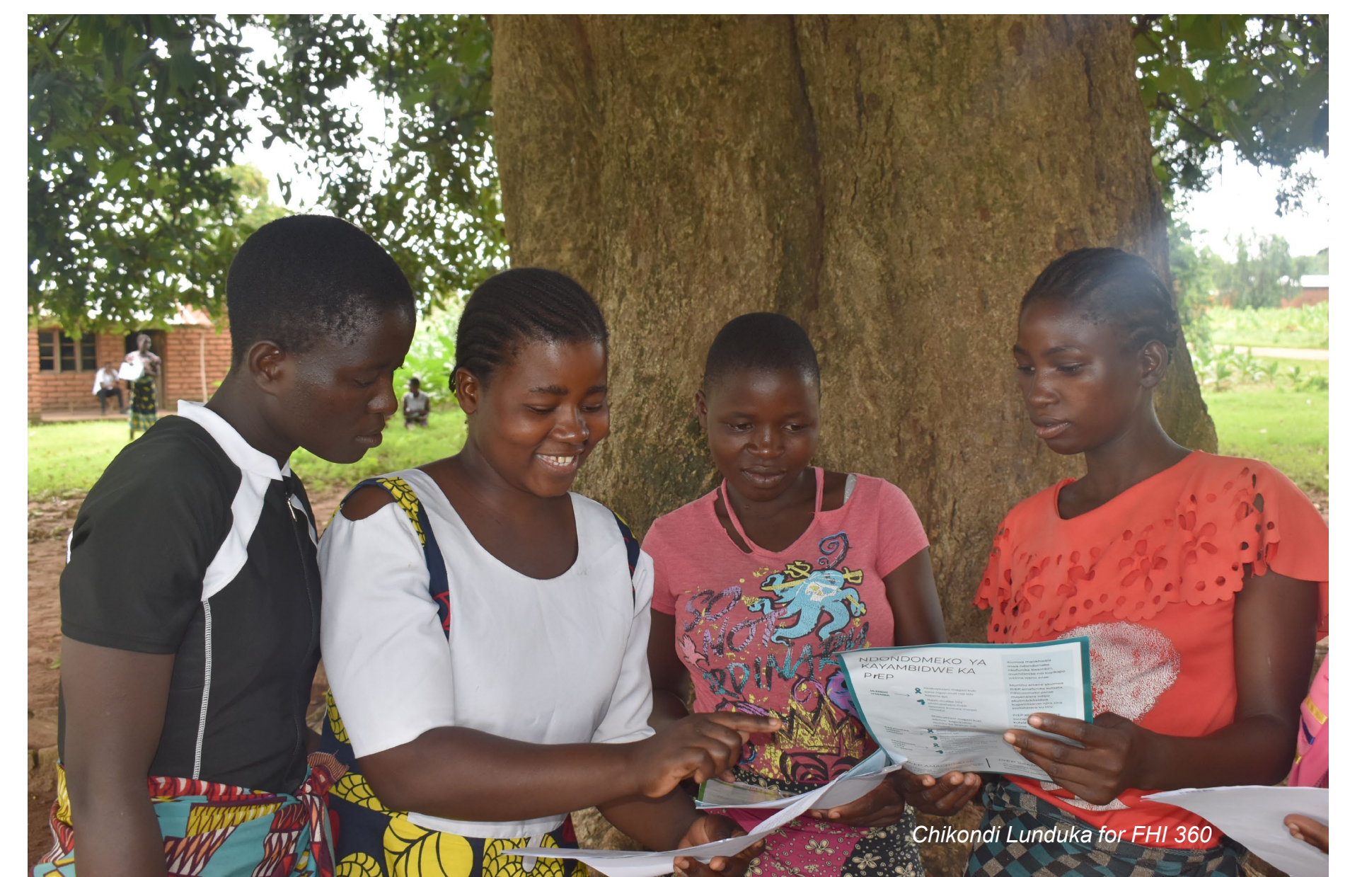
AGYW reading a flier about PrEP, distributed by Malawi EMPOWER, which enables them to make informed decisions. EMPOWER works toward increasing PrEP initiation and continuation to improve HIV prevention outcomes.

Barriers to PrEP uptake were low HIV risk perception, lack of comprehensive knowledge, and stigma. Long distances to PrEP sites was a barrier to continuation. The facilitators included high HIV risk perception, peer/community influence, service providers' attitudes, and integration of PrEP in sexual and reproductive health (SRH) services. In January 2022, we integrated PrEP into club sessions; conducted dialogue sessions targeting traditional/religious leaders, parents, and caregivers of AGYW to destigmatize PrEP; identified PrEP champions; and initiated community-based refills and a PrEP tracker to facilitate targeted counseling and mobilization. This resulted in a 263% and 748% increase in PrEP uptake and continuation, respectively, from January to September 2022 (Figure 1).