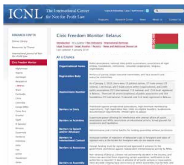
Figure 4. Example of an online source about NGO landscape

International sources like ICNL’s Civic Freedom Monitor may give useful information, which if possible should be cross-checked with official sources and local partners